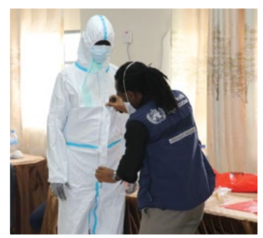
WHO supported the Ministry of Health to conduct a training of laboratory technicians in Juba as part of response to COVID-19

It produced and disseminated over 200 situation reports for informed decision making, conducted a 60-day and 90-day analysis, and released two analysis reports monitoring the outbreak response progress efforts.