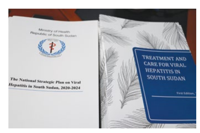
WHO supported South Sudan to develop and launch its first ever National Strategic Plan on Viral Hepatitis and Treatment and Care Guideline for Hepatitis in South Sudan