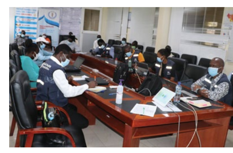
COVID-19 Coordination meeting being conducted at the Public Health Emergency Operation Centre in Juba

The new interactive health service functionality dashboard provides all data and information on infrastructure and service availability to enable evidence-based decision-making, centralizing the healthcare services and data related to it.