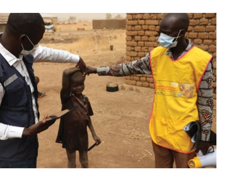
A vaccinator conducting measurement to determine whether the child is eligible to receive Polio vaccine in Wau

Working closely with WHO, MoH declared a circulating vaccine-derived poliovirus type 2 (CVDPV2) outbreak on 18 September 2020, with 37 confirmed cases as of 31 December 2020. In response, the country conducted two phases of monovalent oral polio vaccine type 2 (MOPV2) campaigns in Nov and Dec