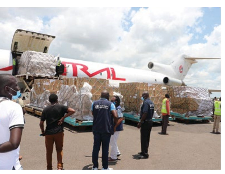
South Sudan received a consignment of PPE to support the COVID19 response