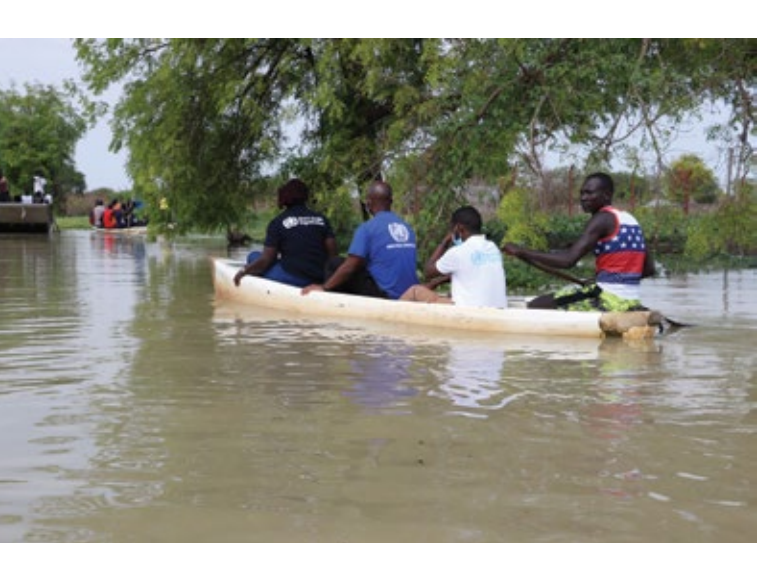
As floods hinder access to several areas, WHO teams use canoes to conduct supervisory visits to hard-to reach vaccination sites during the oral cholera vaccination in Bor County targeting to ensure effective implementation

WHO deployed Emergency Mobile Medical Team (MMT) to Pibor and Bor in Jonglei states to respond to the health consequences of conflict and flooding in the country with much-needed health services reaching population cut-off from routine health service provision. The multi-cluster response approach implemented by WHO in Pibor effectively addressed the needs of the affected population. Working with partners and affected communities helped map and identify areas most in need of health services. Also, leveraging the use of existing structures and health facilities helped ensure emergency response activities' sustainability. WHO also procured and prepositioned emergency medical kits for hard-to-reach areas.