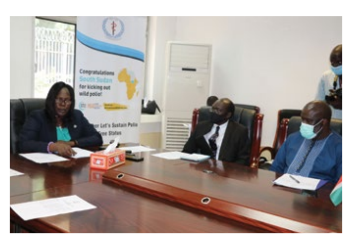
Minister of Health Hon. Elizabeth Acuei Yol and Dr Olushayo Olu, WHO Country Representative in South Sudan speaking to journalists following the declaration of South Sudan free from wild Polio