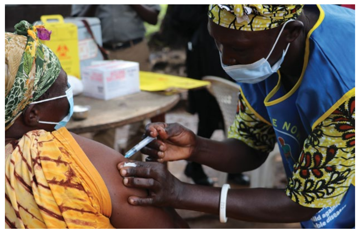
A beneficiary receiving a yellow fever vaccine in Kajo Keji during a campaign to vaccinate 93,000 people against Yellow fever in 2020