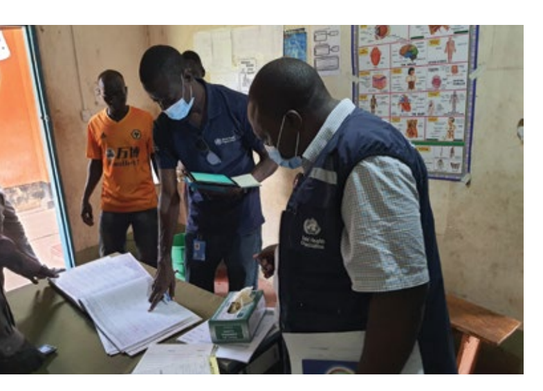
WHO staff conducting monitoring and support supervision visits in health facilities in Torit Eastern Equatoria to assess availability and delivery of health services