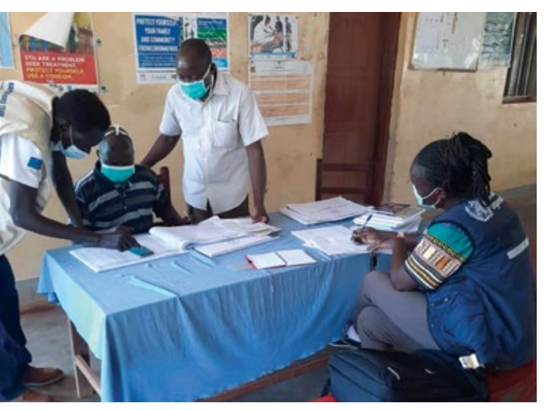
WHO deployed teams from the national & states Ministry of Health to conduct IDSR supportive supervision in health facilities in different states to improve performance