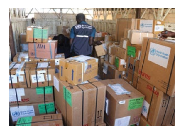
WHO donated 4.5 metric tones of emergency kits and medical supplies to support the floods response